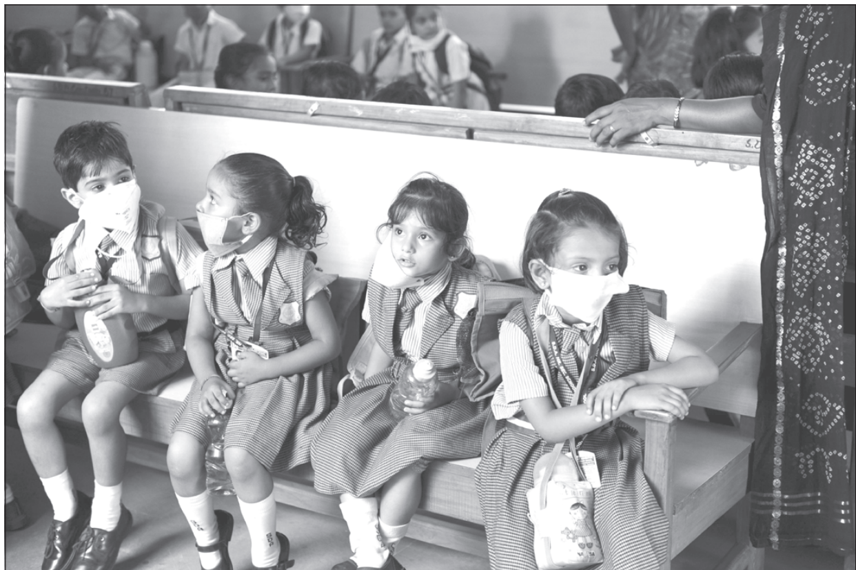
School children wear face masks at school where doctors are performing examinations in Ahmedabad on Wednesday as the death toll due to swine flu in Gujarat state rose to three.